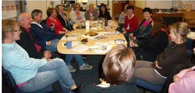
The PTA having an enjoyable moment !!!

The PTA met on Wednesday night this week. We had a great turnout as we usually do.